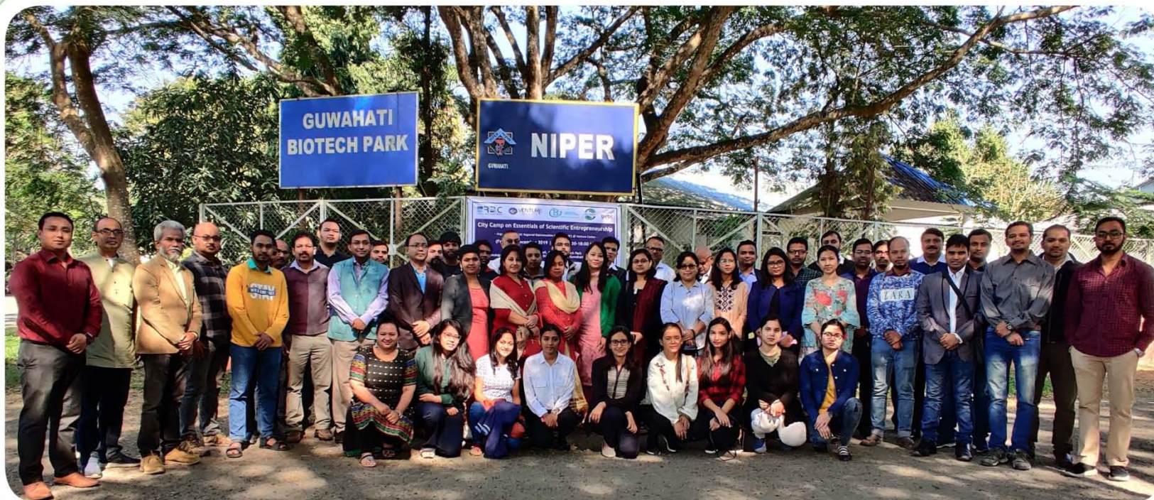
City Camp @ Guwahati Biotech Park, Assam on 6 th December 2019