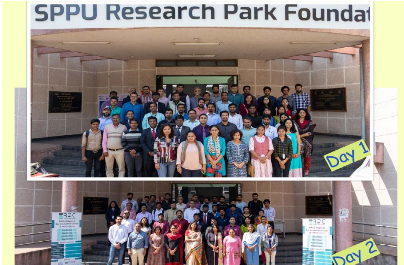
City Camp @ CIIE-SPPU, Maharashtra on 30-31 st Jan 2020