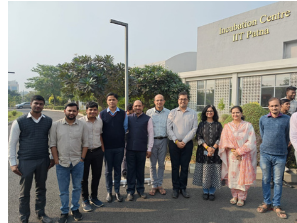
City Camp Organizers Venture Center, IIT Patna Incubation Centre & Zero Lab Bihar Team