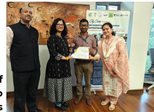
Distribution of certificates to participants